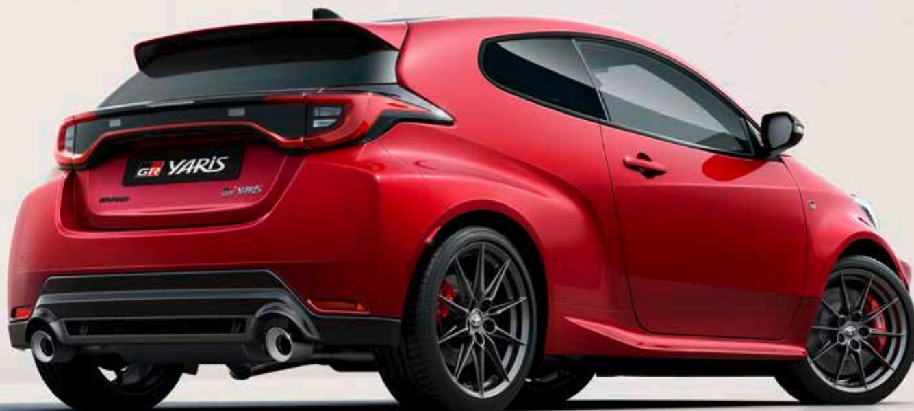
GR Yaris colour choices